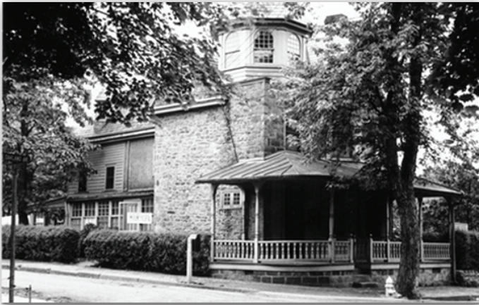
First - Pine Street & Oakland Avenue