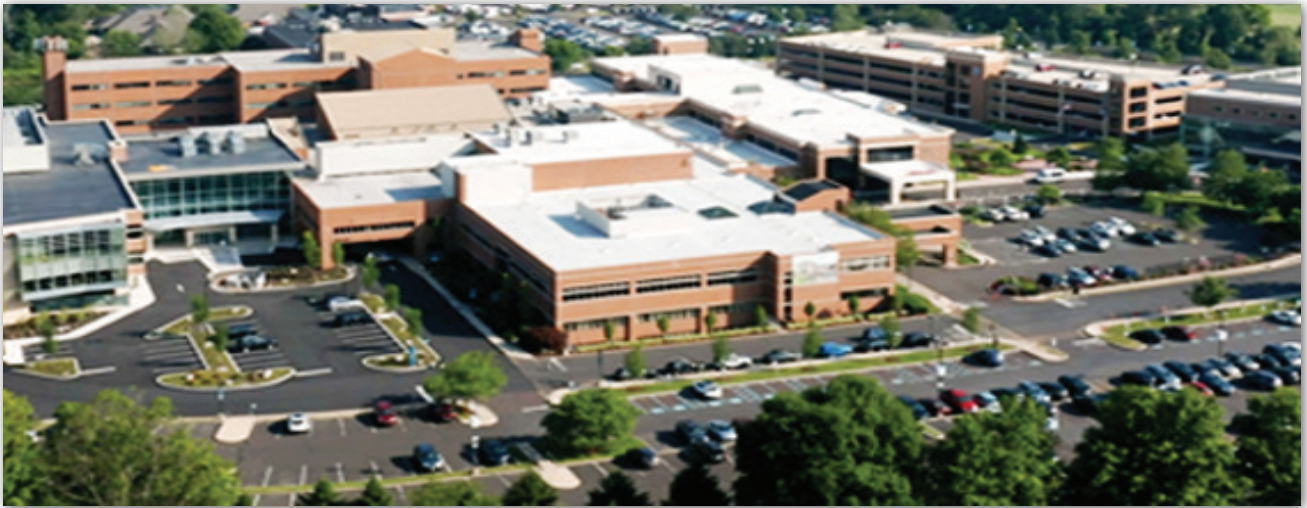
Third - 595 West State Street