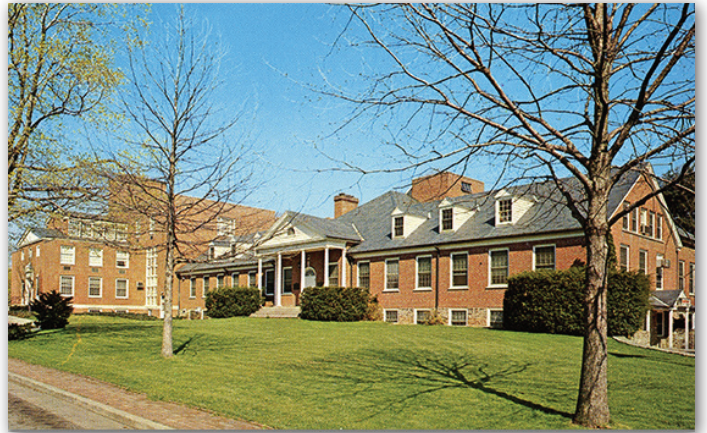
Second - Belmont Avenue