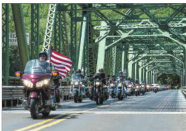
Riders cross the Stockton Bridge during the Ride for the Heroes.