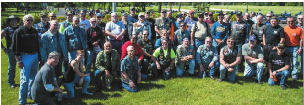
Veterans who participated in the Ride for the Heroes.