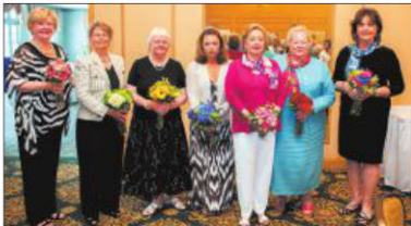
The incoming board of directors.