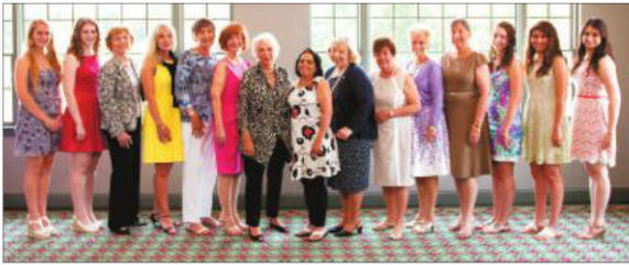
The VIA Scholarship Committee with this year's award recipients.