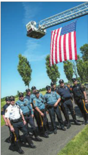
Members of the Newtown, Makefield, Lower Makefield and the Yardley police departments.

The Central Bucks Rotary Club's fourth annual Ride for the Heroes took place June 1.