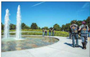
Ride for the Heroes participants walk in the Garden of Reflection, which features two fountains that represent the Twin Towers.